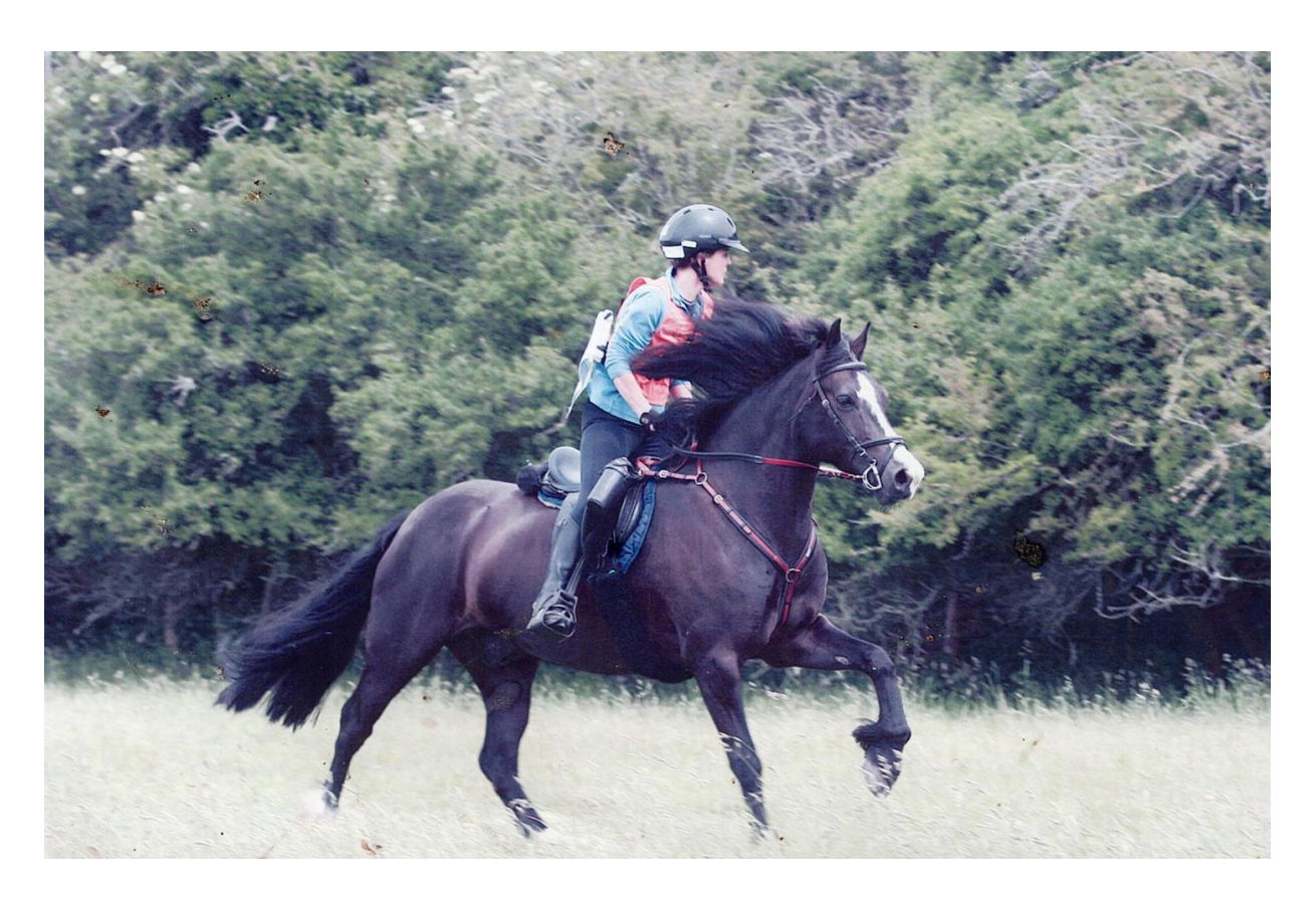
lanto at Breamore

1999?- December 2023 I did everything you asked of me Nothing did I owe Endurance? I adored it Oh, I did so love to go!